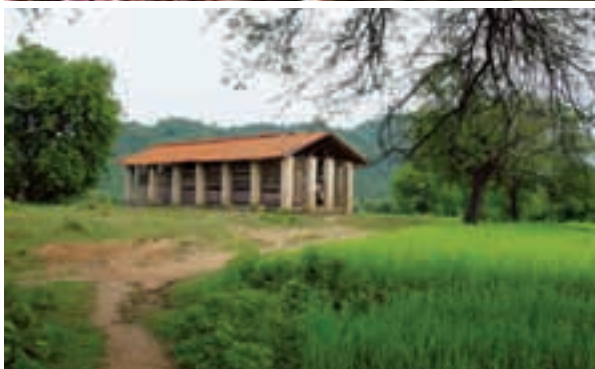
Onions and a low cost onion storage shed